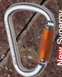
New Synergy KL Auto 22kN 7kN 7kN