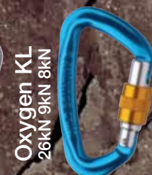
Oxygen KL 26kN 9kN 8kN