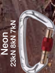
Neon 23kN 8kN 7kN