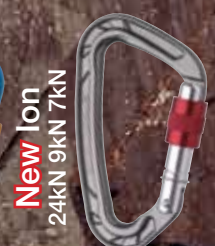
New Ion 24kN 9kN 7kN