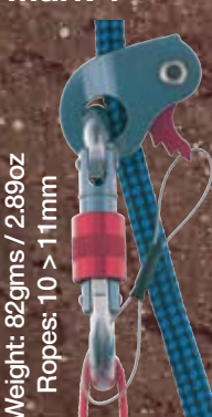
Weight: 82gms / 2.89oz Ropes: 10 > 11mm