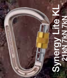
Synergy Lite KL 21kN 7kN 7kN