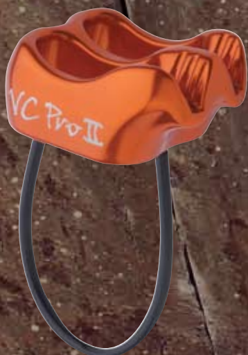
Weight: 80gms / 2.82oz Ropes: 7.7 > 11mm