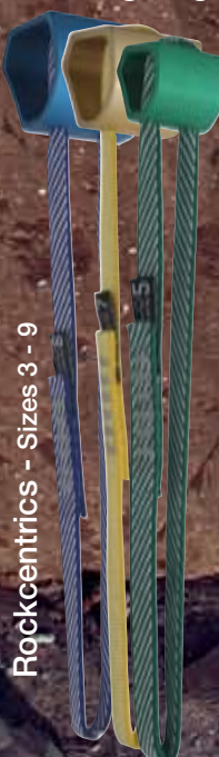
Rockcentrics - Sizes 3 - 9