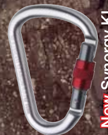
New Synergy KL 22kN 7kN 7kN