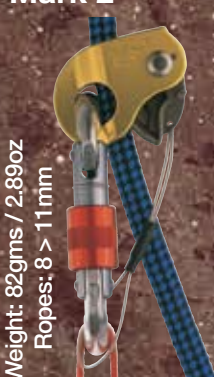
Weight: 82gms / 2.89oz Ropes: 8 > 11mm