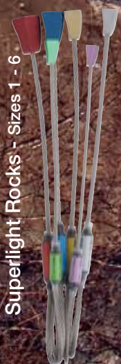
Superlight Rocks - Sizes 1 - 6