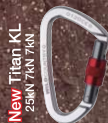
New Titan KL 25kN 7kN 7kN

2010 brings in the Ion, two new Synergy's and a re-worked Titan which means this expansive range has a screwgate for every occasion; from runners to belay, aid or instruction. Equally importantly all these lockers now have Keylock (no-hook) noses giving slicker access and better rope clipping at all times. All Lockers are 3 Sigma Rated, UIAA 121, CE EN 12275, 10kN proof loaded.