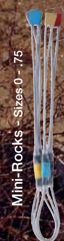
Mini-Rocks - Sizes 0 - .75

Once again the past provides perspective. So as the company that produced the first ever curved nuts, Rocks, it's worth noting when we say that our current range of passive protection creates the best ever rack: tested, refined, with matching anodising and clean lines. Mix and match with: Rocks - lightened, anodised, tapered and tested; Superlights - single wired sinkers; Rockcentrics - big, flexible and forgiving; Mini-Rocks - super slimline re-assurance; and Classics - the original design from the original designers. 3 Sigma Rated, UIAA 122, CE EN 12270